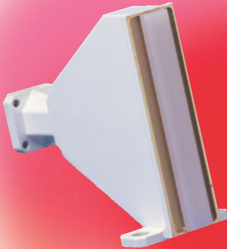
90° Horizontal Polarization